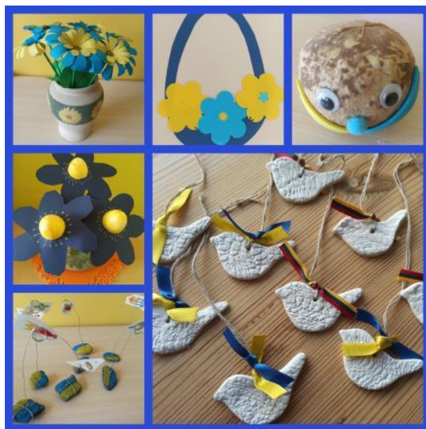
2 foto. The handicrafts made by children of Anykščiai kindergarten „Sindulėlis”

It is very nice that young children from Anyksciai kindergarden "Spindulėlis", with the help of teachers, decided to participate in this project. Young children, age of 4-6 drew, sculpted, made handicrafts, and then sold them to their parents. This is an example of beautiful cooperation with parents, when a nice idea involves parents to school activities.