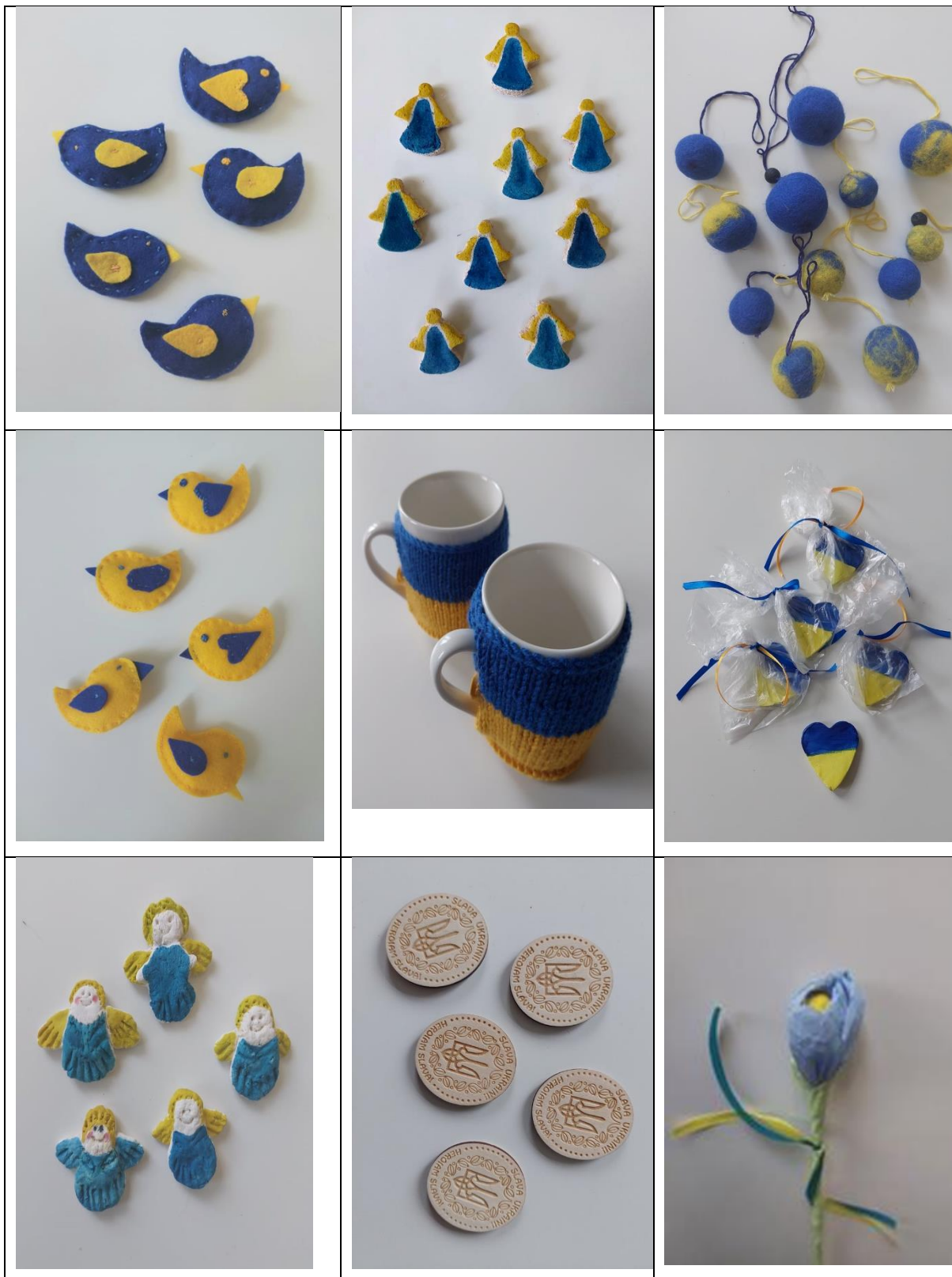
1 foto. The handicrafts made by pupils of Anykščiai Antanas Vienuolis progymnazium.